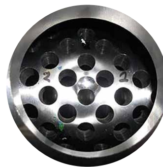
Actual TrimGuard 360 test specimen

Witness testing showed that choke valves fitted with TrimGuard qualify for the upper end of the choke valve impact resistance spectrum, and beyond. The process also proves a high validity between FEA software and final test results on physical valve products.